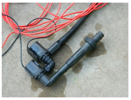
Double pump (two 19 watt pumps connected in series) with an inlet filter, fittings to connect to 19 mm poly pipe, and 9 metres of waterproof electrical cable

You will need to purchase a 40 watt solar panel to connect directly to the pump (no battery required)