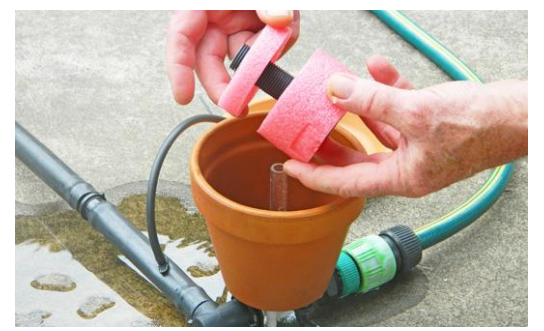
To adjust the interval between irrigation events, adjust the gap between the upper and lower floats

Adjusting the interval between irrigation events does not change the water usage rate. For example, if you decrease the interval between irrigation events by increasing the gap between the upper and lower floats, the amount of water used during the irrigation event increases automatically to ensure that the water usage rate (litres per week for example) remains the same.