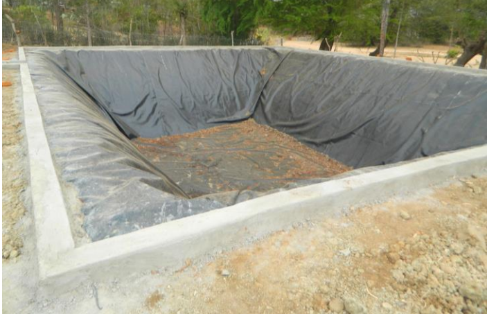
Farm pond in Kenya for gravity feed drip irrigation

It is assumed that the bottom of the farm pond is no more than 4 metres lower than the irrigation drippers. The water supply pressure from the header tank should be at least 1 metre head.