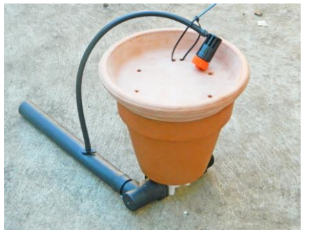
Unpowered Terracotta Valve

As well as the User Manual, the kit includes the following two components: