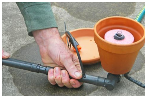
Connect the irrigation application to the outlet