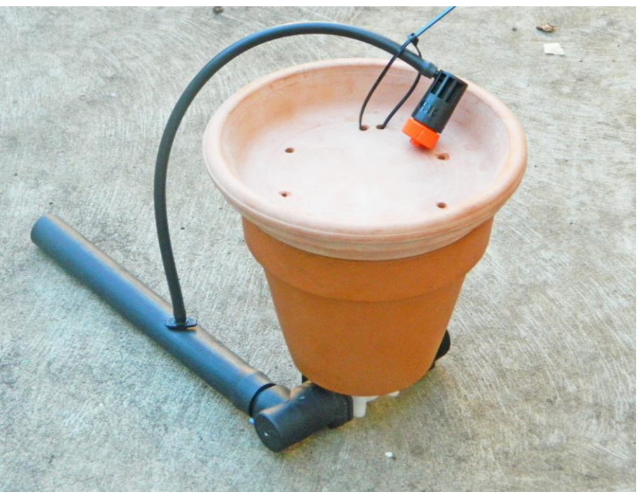
Unpowered Terracotta Valve