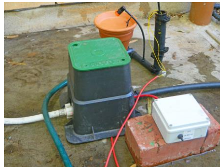
Place the terracotta saucer on the terracotta pot and adjust the control dripper so that it drips into the pot

Step 3. Place the terracotta saucer on the terracotta pot and position the adjustable control dripper so that it drips water into the pot during the irrigation event.