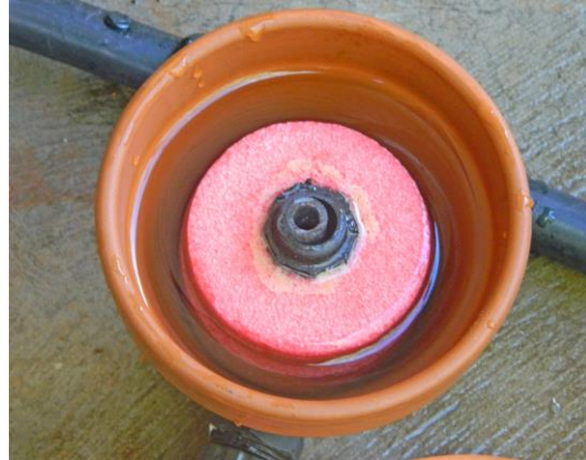
Lid removed to show float and water level

A clear acrylic tube connected to the valve is quite fragile, so be very careful not to break it.