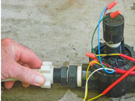
Connect the water supply to the inlet of the solenoid valve

The water supply pressure at the inlet of the solenoid valve should be the same as the water supply pressure at the inlet of the Terracotta Irrigation Controller for Solenoid Valves.