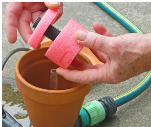
To adjust the interval between irrigation events, adjust the gap between the upper and lower float

Adjusting the interval between irrigation events does not change the water usage rate. For example, if you increase the interval between irrigation events by increasing the gap between the upper and lower float, the amount of water used during the irrigation event increases automatically to ensure that the water usage rate remains the same.