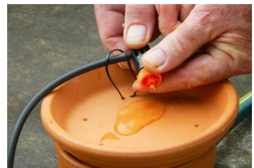
The control dripper is adjustable.

It is important to note that the control dripper is adjustable. If you reduce the flow rate of the control dripper, it takes a lot longer for the control volume of water to drip into the pot and so the duration of the irrigation event increases and your plants get more water. On the other hand, if you increase the low rate of the control dripper, the control volume of water drips into the pot more quickly and so the duration of the irrigation event decreases and your plants get less water. Adjust the control dripper so that the irrigation delivers the appropriate amount of water to your plants at their current stage of growth.