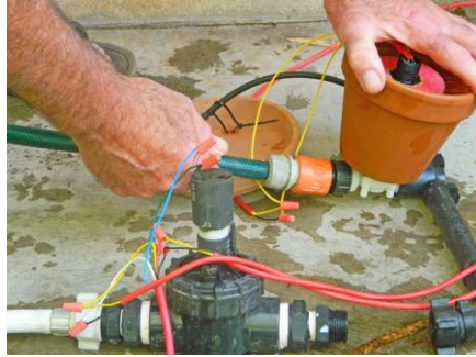
Connect the water supply to the inlet of the controller