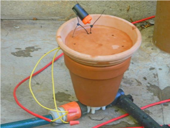
Terracotta Irrigation Controller

Terracotta is porous and so the water level in the pot falls as water seeps through the pot. A float inside the pot floats on the water. When the water level reaches the low level, a magnet inside the float activates the valve so that the valve opens. A signal is sent to the control box and the irrigation starts. During the irrigation event a control dripper drips water into the pot and the water level rises. When the water level reaches the high level, the magnet inside the float disengages from the valve so that the valve closes. After a short delay (less than 2 minutes), a signal is sent to the control box and the irrigation stops.