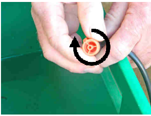
Turn the control dripper clockwise to reduce the flow rate

If your plants are getting too much water, turn the control dripper anticlockwise to increase the flow rate of the control dripper.