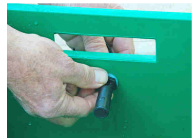
Install the float switch

Step 3. Use the hole to install the float switch so that the float swings up (or the float shaft points up). Connect the wires from the float switch to the white and yellow wires from the control box.