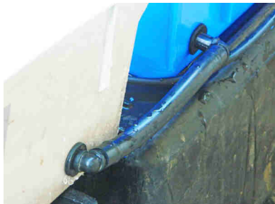
Connecting two evaporators

You can decrease the surface area of evaporation by placing full bottles of water in the evaporator.