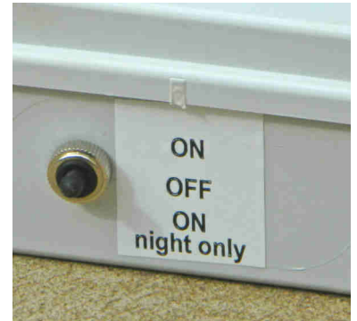
Switch with 3 positions: ON, OFF, ON night only