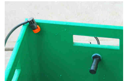
Position the adjustable control dripper so that it drips water into the evaporator