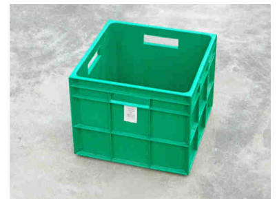
A hobby box makes an ideal evaporator

Step 1. Choose a suitable evaporator. The evaporator is a plastic container with vertical sides with an opening of at least 20cm x 20cm and a height of at least 15cm (a hobby box is ideal).