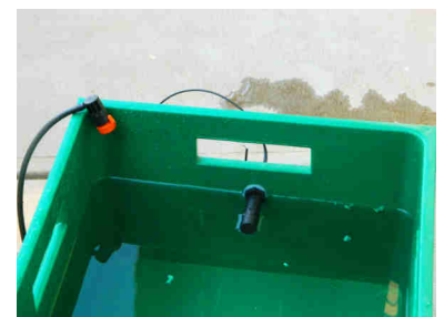
Fill the evaporator