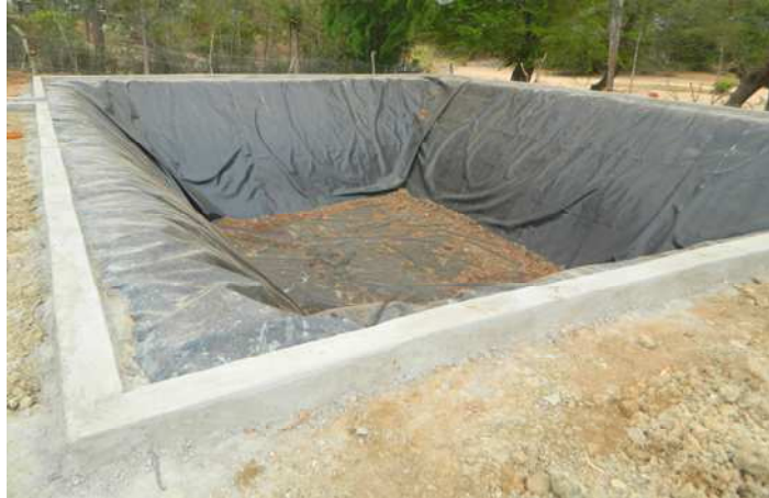
Farm pond in Kenya for gravity feed drip irrigation

It is assumed that the bottom of the farm pond is no more than 4 metres lower than the irrigation drippers. The water supply pressure from the header tank should be at least 1 metre head.