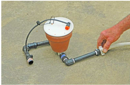
Connect the water supply to the inlet pipe

Connect the water supply from the header tank to the inlet pipe and connect the irrigation application to the outlet pipe (note that the control dripper is connected to the outlet pipe).