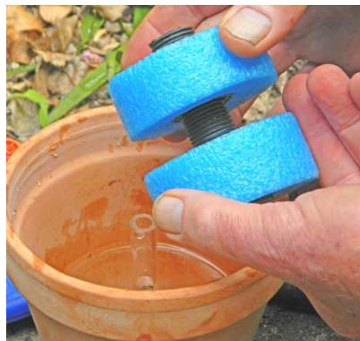
To adjust the interval between irrigation events, adjust the gap between the upper and lower floats

Adjusting the interval between irrigation events does not change the water usage rate. For example, if you decrease the interval between irrigation events by increasing the gap between the upper and lower floats, the amount of water used during the irrigation event increases automatically to ensure that the water usage rate (litres per week for example) remains the same.