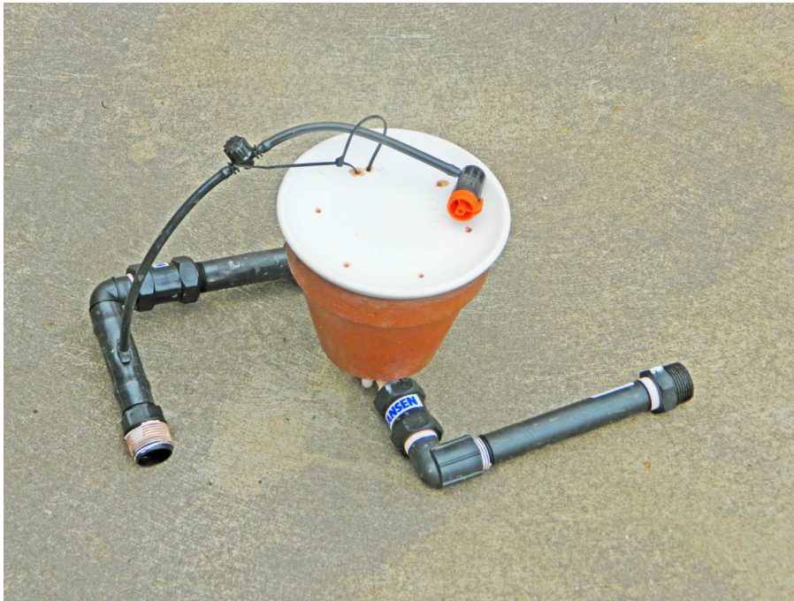
Unpowered Terracotta Irrigation Controller