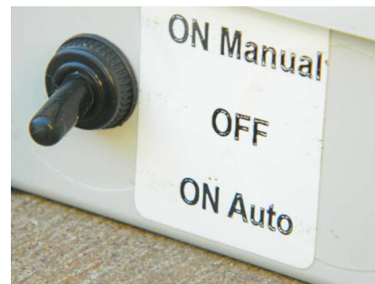
Pump controller with the switch in the ON Auto position

There is a 30 second delay between the float switch turning off and the stopping of the pump.