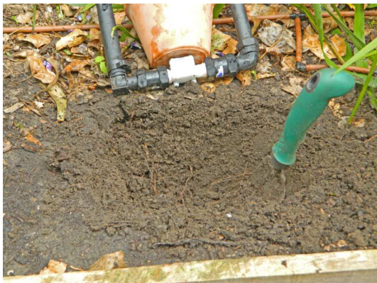
Step 7.1. Dig a hole midway between two adjacent plants. There should be no irrigation drippers near these two plants.

In ground installation is ideal for drip irrigation of row crops. Follow the installation steps below.