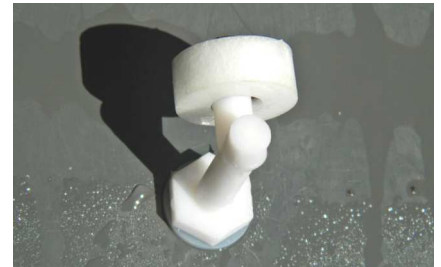
Float switch on the inside of the header tank with the float shaft pointing up

Drill a 13 mm (half inch) hole in the side of the header tank so that the hole is about 5 cm lower than the inlet to the header tank. Install the float switch on the inside of the header tank so that the float shaft points up.