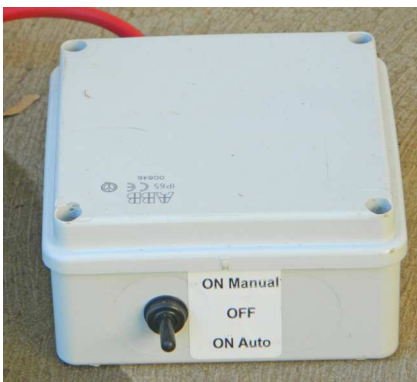
Waterproof pump controller with solar charge controller inside

As well as the User Manual, the kit includes the following four components: