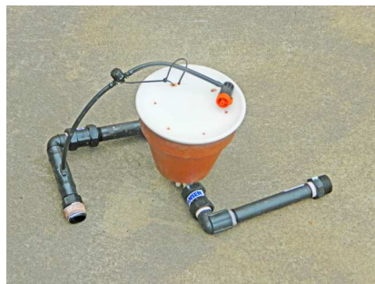
Unpowered Terracotta Irrigation Controller

The following items will be required to install the kit and may be purchased locally: