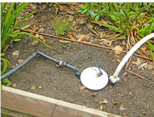
Step 7.3. Connect the water supply to the inlet pipe and connect the irrigation application to the outlet pipe.

Because the terracotta pot is in the ground near the roots of plants, the Unpowered Terracotta Irrigation Controller responds to changes in plant transpiration. As the crop grows and requires more water, the irrigation frequency increases automatically.