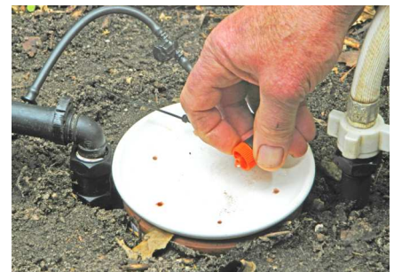
The control dripper is adjustable.

It is important to note here that the control dripper is adjustable. If you reduce the flow rate of the control dripper, it takes a lot longer for the control volume of water to drip into the pot and so the duration of the irrigation event increases and your plants get more water. On the other hand, if you increase the flow rate of the control dripper, the control volume of water drips into the pot more quickly and so the duration of the irrigation event decreases and your plants get less water. Adjust the control dripper so that the irrigation delivers the appropriate amount of water to your plants at their current stage of growth.