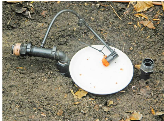
Step 7.2. Adjust the inlet and outlet pipes so that they are vertical. Position the controller in the hole so that rim of the pot is above ground level. Back fill the soil around the pot.