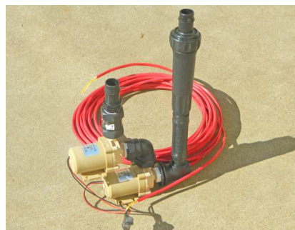
Double pump (two pumps connected in series) with an inlet filter, fittings to connect to 19 mm poly pipe, and 9 metres of waterproof electrical cable