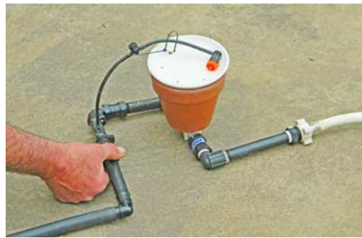
Connect the irrigation application to the outlet pipe