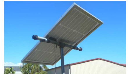
Solar panel mounted on a pole

A 12 volt 20 watt solar panel should provide all the power required.