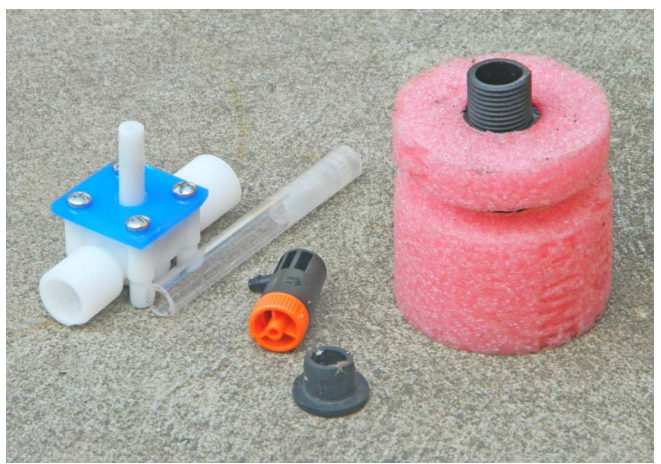
Unpowered Terracotta Valve