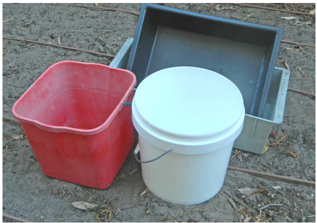
Examples of suitable control containers

Without spending any money, you can install an irrigation controller that responds to the prevailing onsite weather conditions, namely evaporation and rainfall. All that is needed is a suitable control container.