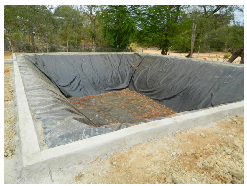
Farm pond in Kenya

It is recommended that you watch the YouTube video DIY Solar Drip Irrigation Kit: <u>https://www.youtube.com/watch?v=rVkkQvdJa4g</u>