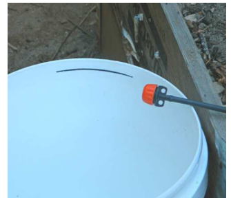
The adjustable dripper drips water into the evaporator during the irrigation event

Step 2. Connect the adjustable dripper to the irrigation system and position the evaporator so that the adjustable dripper drips water into the evaporator during the irrigation event. The adjustable dripper should be at the same level as the irrigation drippers. The adjustable dripper is called the control dripper .