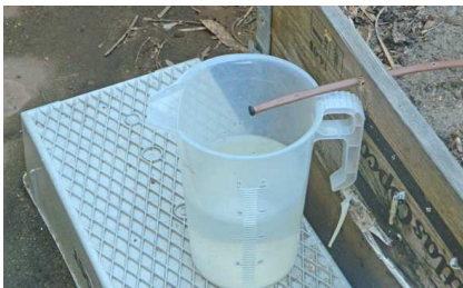
Check the volume of water in the measuring container.

Check the volume of water in the measuring container at the end of the irrigation event. If the volume in the measuring container is less than the dripper control volume, then the wetting front is unlikely to have reached the bottom of the root zone. So reduce the flow rate of the control dripper (to increase the duration of the irrigation event) in preparation for the next irrigation. If the volume in the measuring container is more than the dripper control volume, then the wetting front is probably below the bottom of the root zone. So increase the flow rate of the control dripper (to decrease the duration of the irrigation event) in preparation for the next irrigation.