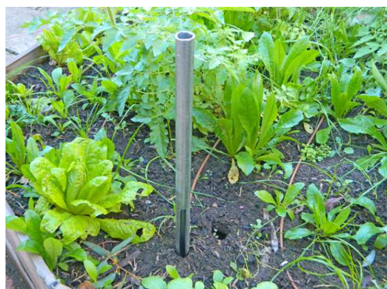
Hammer the steel pipe into the soil near a dripper so that the slot faces the dripper.