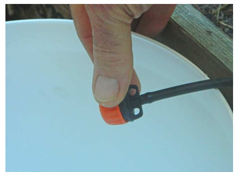
Adjust the control dripper so that flow rate is about the same as the flow rate of the irrigation drippers

Step 4. Adjust the control dripper so that flow rate is about the same as the flow rate of the irrigation drippers.