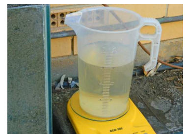
Reweight the container to determine the volume of water that has evaporated

Reweight the container to determine the volume of water that has evaporated. The number of mm that has evaporated is the volume of water divided by the surface area of the container. This is called the root zone evaporation and it is the evaporation required to dry out the soil from the surface to the bottom of the root zone.