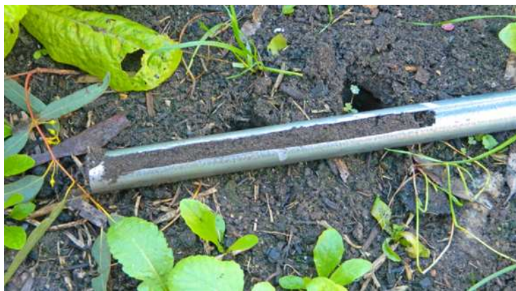
Remove the steel pipe from the soil and use the slot to inspect the moisture level in the soil and the position of the wetting front.