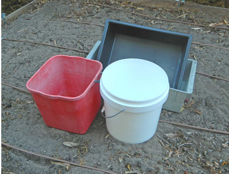
Examples of suitable evaporators

The evaporator is any container with vertical sides, with a surface area of at least 0.05 m 2 , and a depth of at least 0.1 m.