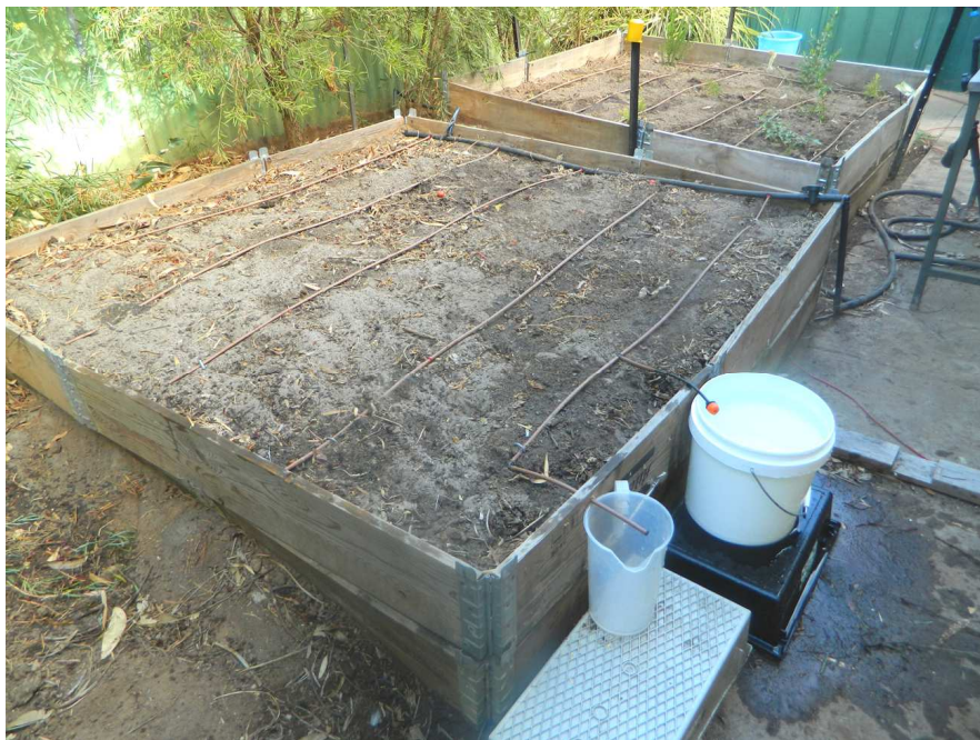
Garden beds being irrigated by manual measured irrigation

Manual measured irrigation can be used for sprinkler irrigation as well as drip irrigation.