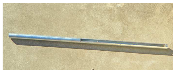
An angle grinder can be used to make a long slot in a length of steel pipe