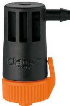
Claber 91214 adjustable dripper

Provided that the drip irrigation system does not use pressure compensating drippers, any adjustable dripper may be used. For precision and consistency Claber 91214 adjustable dripper is recommended.