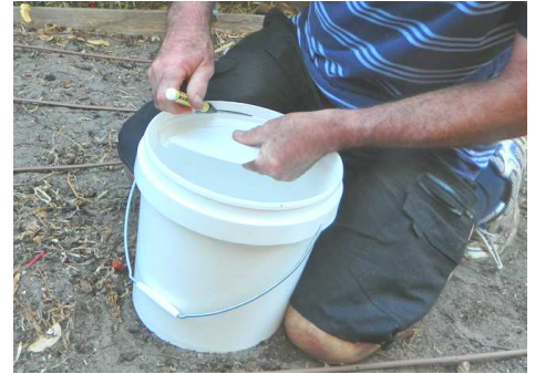
Draw a line on the inside of the evaporator about 1.5 cm below the overflow level

Step 1. Draw a line on the inside of the evaporator about 1.5 cm below the overflow level. This line corresponds to the high level.