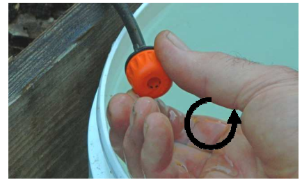
If the volume in the measuring container is more than the dripper control volume, turn the control dripper anticlockwise to increase the flow rate of the control dripper.

Repeat Steps 3 and 4 until the volume of water in the measuring container matches the dripper control volume. It is preferable that the above steps are done in a period when there is no rain.