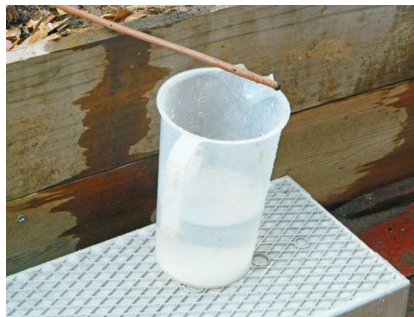
Dripper control volume for root zone scheduling

By following this procedure the volume of water that each dripper discharges during the irrigation event can be adjusted to match the dripper control volume. Alternatively, your knowledge of your plants requirements at their current stage of growth can be used to adjust the volume the volume of water that each dripper discharges during the irrigation event.