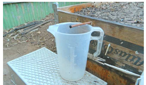
Place a measuring container under one of the irrigation drippers

Step 3. Place a measuring container under one of the irrigation drippers.