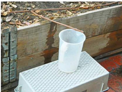
Place a measuring container under one of the irrigation drippers

The volume of water in the measuring container is the dripper control volume and it is the amount of water that each dripper should deliver during the irrigation event to moisten the soil from the surface to the bottom of the root zone.