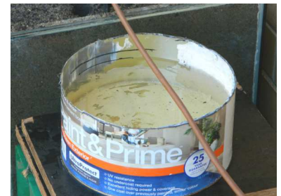
Start irrigating when the water level is at the low level

Check the water level at sunset each day, and start irrigating again when the water level has fallen below the low level.