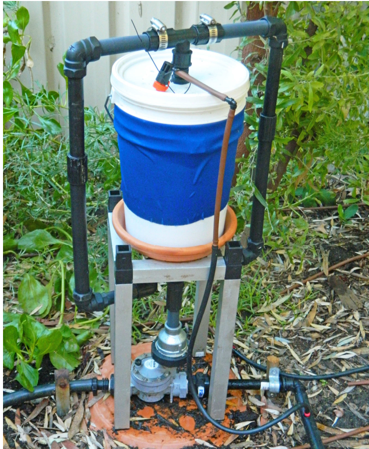
Unpowered Wicking Irrigation Controller