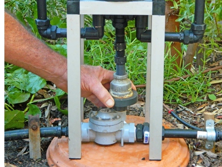
Rotate the magnet to progressively lower the magnet over the solenoid until the magnet activates the solenoid and the irrigation starts

Step 5. Connect the adjustable control dripper to the irrigation system and use the cable tie to position the control dripper so that it drips water onto the lid of the container. There are six small holes in the lid so that the water can drain into the container.