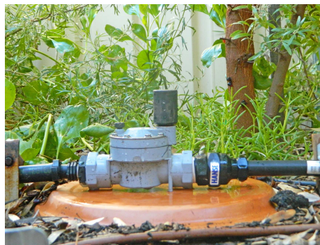
Solenoid valve with wires removed in a location where the evaporation at the valve matches the evaporation from the soil

Step 2. As power is no longer required to operate the solenoid, you may wish to cut off the two wires connected to the solenoid. It is preferable that the solenoid valve is in a location where the evaporation at the valve matches the evaporation from the soil. For example, if the garden is in full sun, then the valve should also be in full sun.