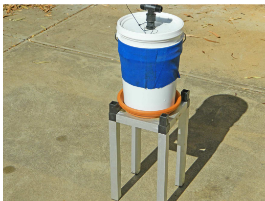
Step 4. Place the container on the terracotta saucer on the stand