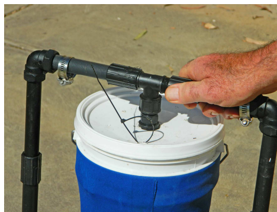
Step 5. Use the two sockets to connect the external frame of the float assembly to the upper tee of the float assembly