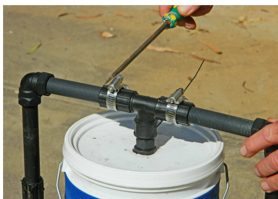
Step 6. Use a screw driver to tighten the clamps

To remove the float and the polyester cloth, do the steps in reverse order.