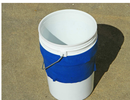
Step 2. Insert the inner container into the outer container