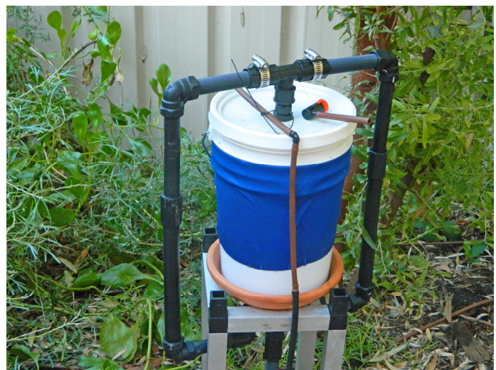
A polyester cloth wicks water from inside the container to outside the container to evaporate

An irrigation system with a conventional irrigation controller can be upgraded to an unpowered system where each solenoid valve is controlled by a UWIC. The conventional irrigation controller and the associated wiring become redundant.