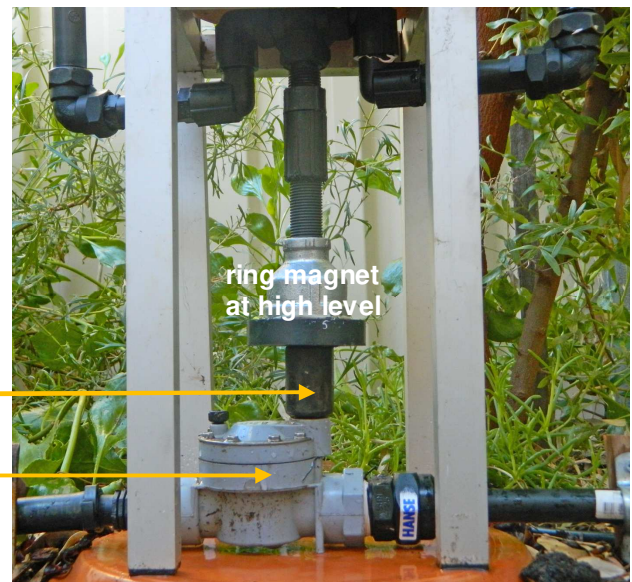
Ring magnet and float at the high level at the end of the irrigation event

Once correctly calibrated, the UWIC only sends water when plants need it and does not overwater. It responds to the same local weather conditions as the soil. Deep or shallow watering, frequent or delayed watering – all can be accommodated. You don't have to 'turn it off' over winter as rain and cooler temperatures keep the container from drying out. You can leave your irrigation system unattended for months on end.