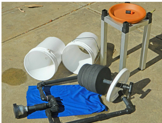
Components of the Unpowered Wicking Irrigation Controller