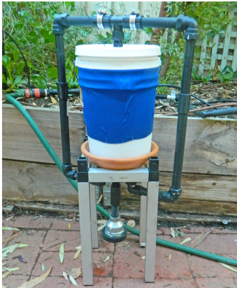
Unpowered Wicking Irrigation Controller prior to installation