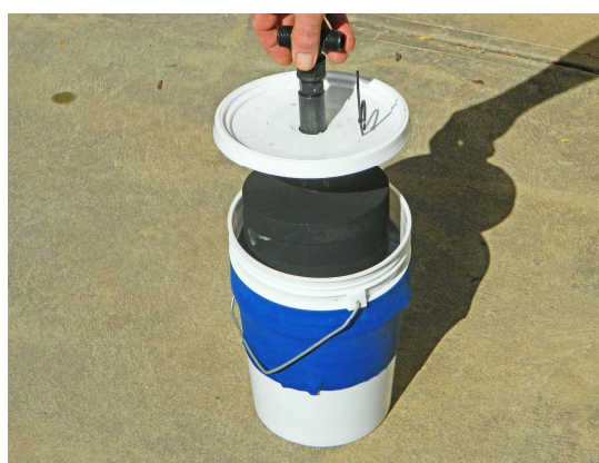
Step 3. Insert the float