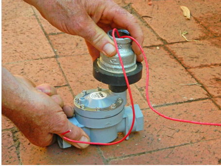
Check that the ring magnet can activate the solenoid

If the ring magnet does not activate the solenoid, two ring magnets joined together should be strong enough to activate the solenoid. For example, Hunter solenoids valves require two ring magnets to activate the solenoid.