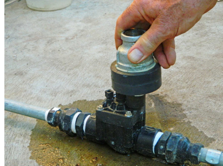
Hunter solenoids require two ring magnets

It is assumed that the solenoid is non-latching.