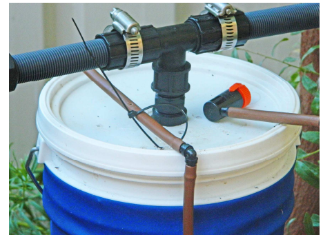
The adjustable control dripper is replaced by one of the dripline irrigation drippers

If the water supply pressure decreases, the flow rate of the NPC drippers also decreases. However, the duration of the irrigation event increases automatically to ensure that the control volume of water is discharged by each dripper. For domestic gardens on level ground, the irrigation system can usually be designed so that variations in pressure due to frictional head loss are negligible.