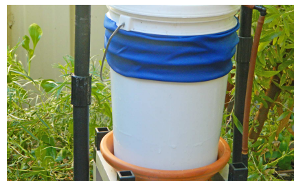
Small area of polyester cloth exposed

The control volume depends on the particular solenoid being used. The following table shows the control volume of a number of solenoids from different manufacturers.