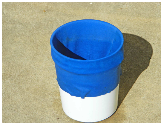
Step1. Wet the polyester cloth and place it over the outer container so that the desired exposed surface area forms a skirt around the outside of the container