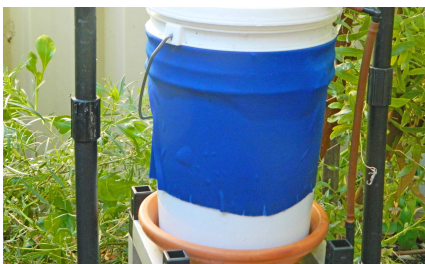
Large area of polyester cloth exposed

Next, you set the frequency of watering by adjusting how quickly water evaporates from the container. This is done by exposing more or less of the polyester cloth outside the container. To make this adjustment you may need to remove the float from the container (see Appendix). The time interval between irrigation events can be from half a day to a week or longer.