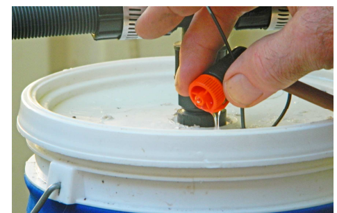
Adjusting the control dripper

First, you set how much water is discharged from each emitter during the irrigation event by adjusting how long it takes for the control dripper to deliver the control volume to the container. So while the container is filling, the plants are being watered. The time it takes to fill the container is adjusted by changing the flow rate of the control dripper (by turning the orange part). If you set the control dripper to a fast flow rate, the container fills more quickly; thus there will be less time for watering and the plants receive less water. If you set the control dripper to a slow flow rate, the container fills more slowly and the plants receive more water.