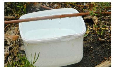
Measuring the pressure independent dripper discharge

To determine the pressure independent dripper discharge (control volume), position an empty container under one of the drippers so that water drips into the container during the irrigation event. At the end of the irrigation event, the pressure independent dripper discharge is the volume of water in the container