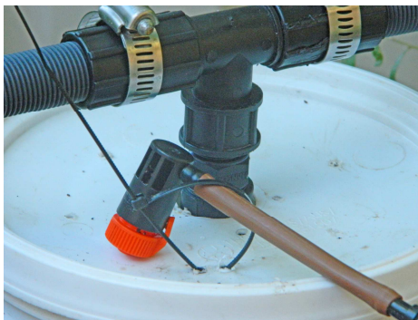
Use the cable tie to position the control dripper so that it drips water into the container via the lid of the container

Step 5. Connect the adjustable control dripper to the irrigation system and use the cable tie to position the control dripper so that it drips water onto the lid of the container. There are six small holes in the lid so that the water can drain into the container.