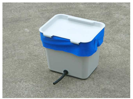
Adjust the interval between irrigation events by adjusting the exposed surface area of polyester cloth