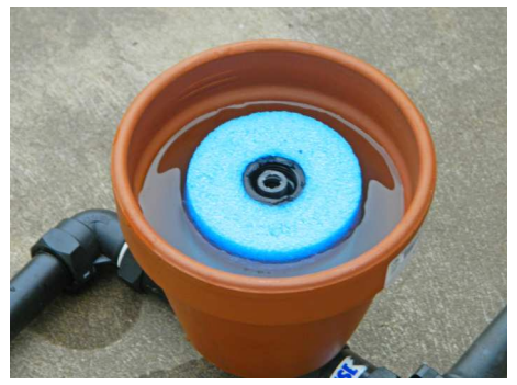
Float and the water level

Terracotta is porous and so the water level in the pot falls as water seeps through the pot. A float inside the pot floats on the water. When the water level reaches the low level, a magnet inside the float activates the valve so that the valve opens, water rises up the vertical tube, the float switch opens, the solenoid valve opens and the irrigation starts. During the irrigation event a control dripper drips water into the pot and the water level rises. When the water level reaches the high level, the magnet inside the float disengages from the valve so that the valve closes, water drains from the vertical tube, the float switch closes, the solenoid valve closes and the irrigation stops.