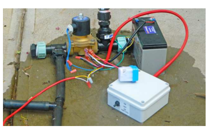
Eleven colour-coded wires connected to the relevant components

Connect the red wire to the positive terminal from the 12V DC power supply.