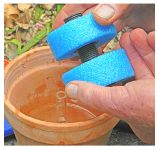
To adjust the interval between irrigation events, adjust the gap between the upper and lower floats

Adjusting the interval between irrigation events does not change the water usage rate. For example, if you increase the interval between irrigation events by increasing the gap between the upper and lower floats, the amount of water used during the irrigation event increases automatically to ensure that the water usage rate remains the same.