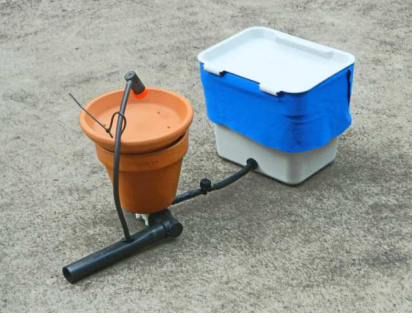
Control Volume Boost Container connected to the drain valve on the terracotta pot