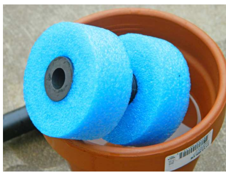
Float showing the ring magnet at the bottom of the float