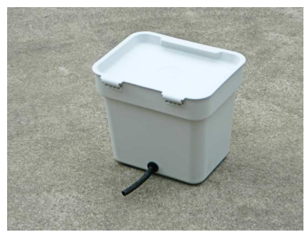
Control Volume Boost Container

The Control Volume Boost Container can be connected to the drain valve on the terracotta pot so that the water level in the container is the same as the water level in the terracotta pot. By using the Control Volume Boost Container, the control volume can be set to any value between 500 ml and 1600 ml (see Table 2). The Control Volume Boost Container can be purchased online at the Measured Irrigation website. A polyester cloth is provided to wick water from inside the container to outside the container to evaporate. Make sure that the polyester cloth is wet at all times. The interval between irrigation events is determined by how quickly water evaporates from the container via the polyester cloth. In additional to adjusting the float, the interval between irrigation events can also be adjusted by exposing more or less of the polyester cloth outside the container. The lid on the container protects the water in the container from debris, algae, mosquitoes and thirsty animals.