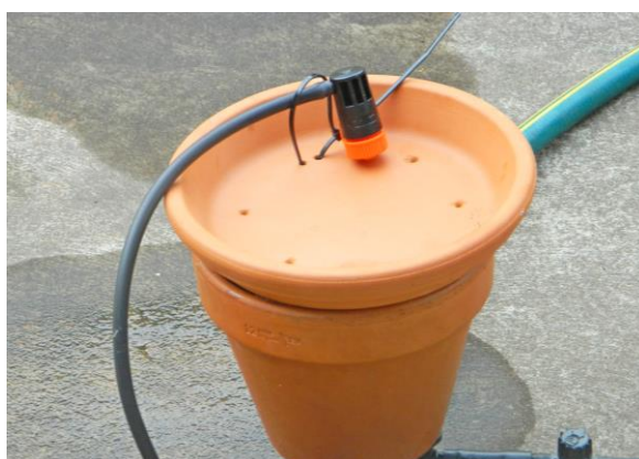
Place the terracotta saucer on the terracotta pot so that the control dripper drips water into the pot