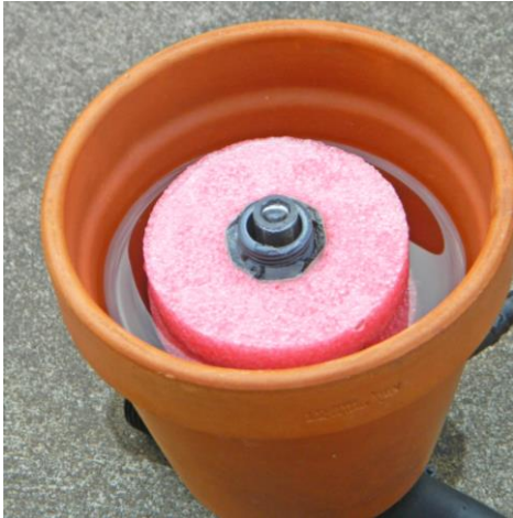
Unpowered Terracotta Irrigation Controller showing the float and the water level

Terracotta is porous and so the water level in the pot falls as water seeps through the pot. A float inside the pot floats on the water. When the water level reaches the low level, a magnet inside the float activates the valve so that the valve opens and the irrigation starts. During the irrigation event a control dripper drips water into the pot and the water level rises. When the water level reaches the high level, the magnet inside the float disengages from the valve so that the valve closes and the irrigation stops.