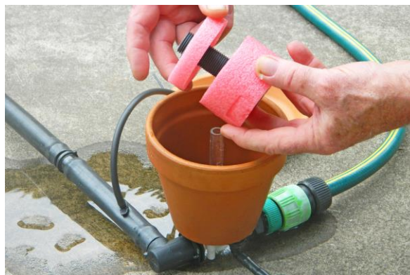
To adjust the interval between irrigation events, adjust the gap between the upper and lower float

Adjusting the interval between irrigation events does not change the water usage rate. For example, if you increase the interval between irrigation events by increasing the gap between the upper and lower float, the amount of water used during the irrigation event increases automatically to ensure that the water usage rate remains the same.