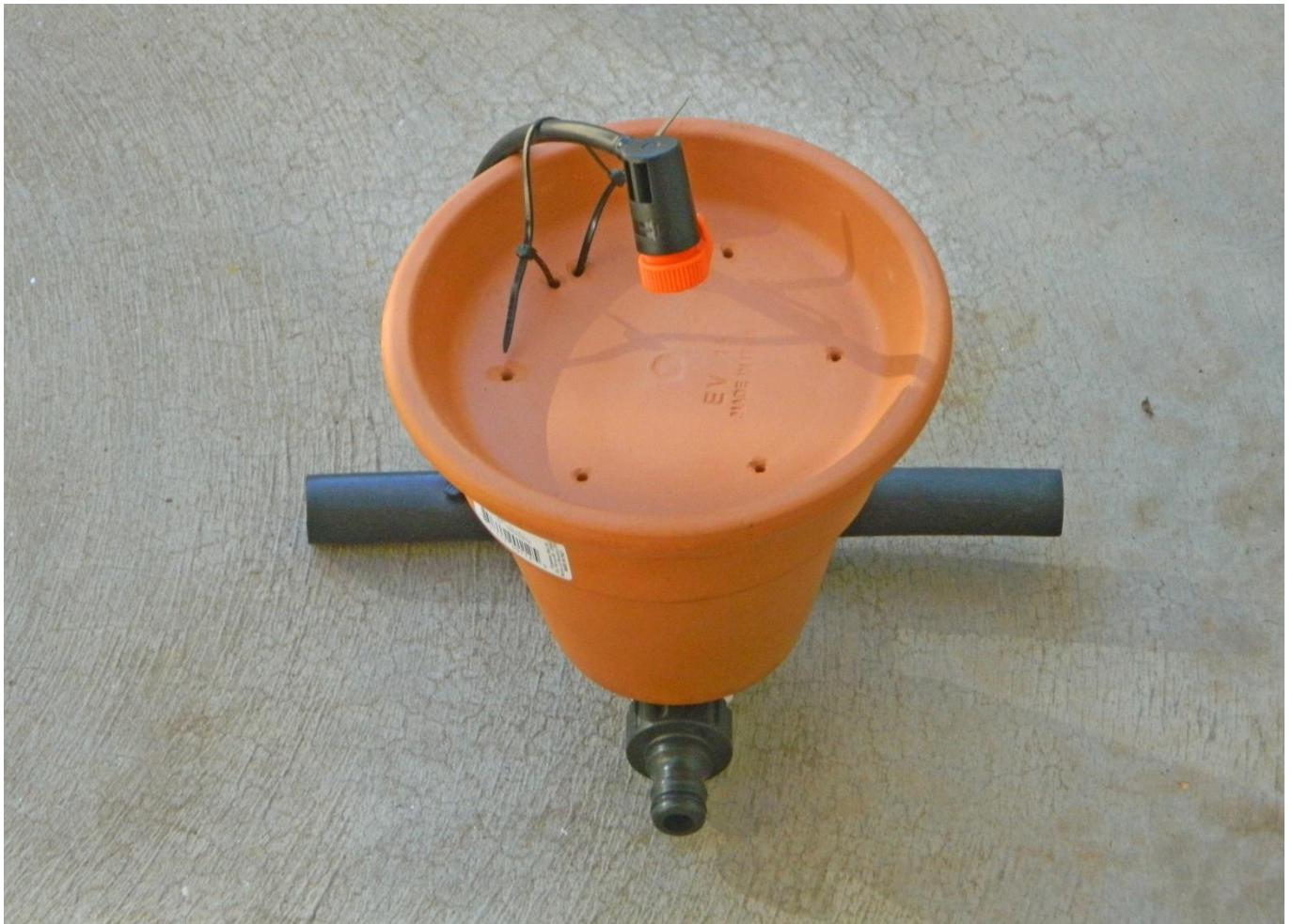
Unpowered Terracotta Irrigation Controller