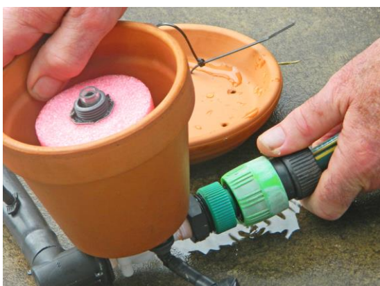
Connect the water supply to the valve inlet

Connect the control dripper to the irrigation application. Place the terracotta saucer on the terracotta pot so that the control dripper drips water into the pot. The control dripper should be at the same level as the irrigation drippers in your application.