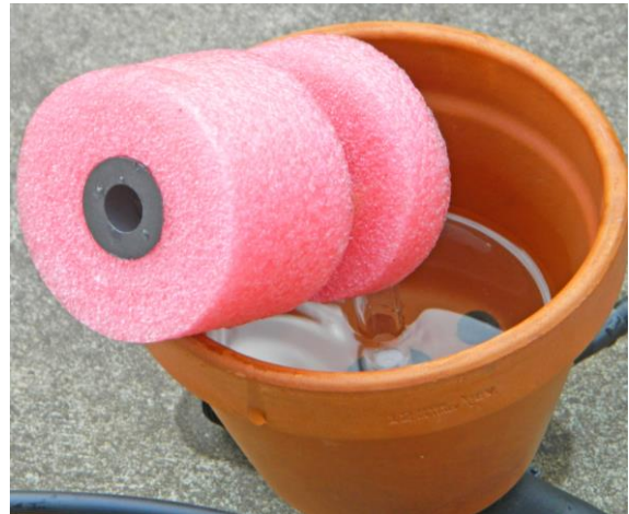
Float showing the ring magnet at the bottom of the float

This remarkable low-cost invention may enable poor smallholders in remote locations to grow higher-valued crops cost-effectively.