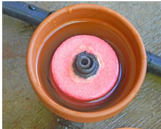
Lid removed to show float and water level

A clear acrylic tube connected to the valve is quite fragile, so be very careful not to break it.