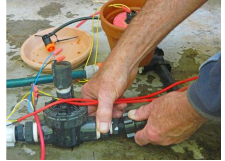
Connect the irrigation application to the outlet of the latching solenoid valve

Step 3. Place the terracotta saucer on the terracotta pot and position the adjustable control dripper so that it drips water into the pot during the irrigation event.