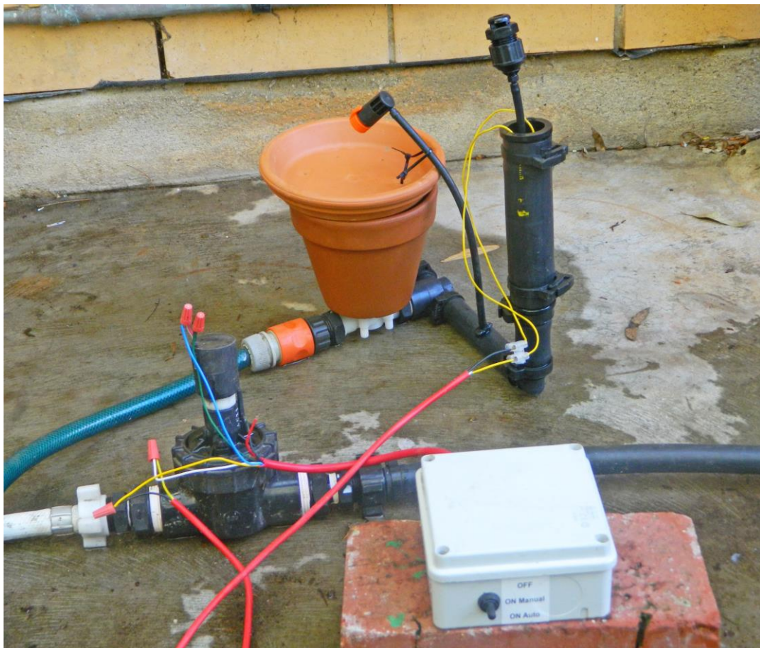
Terracotta Irrigation Controller for Latching Solenoids